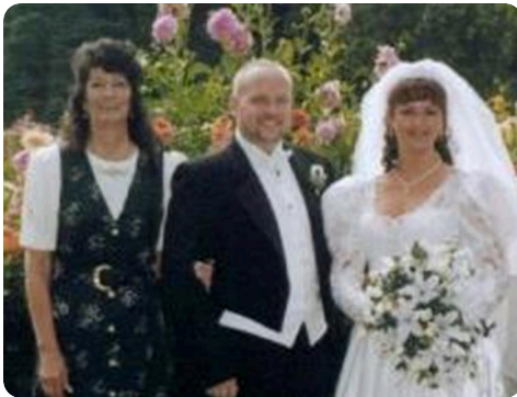
My Wedding Day - 09.19.98